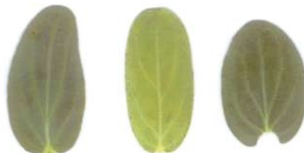
Habit and leaves of three morphotypes