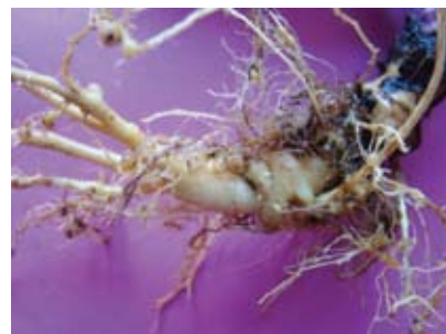
Severely infected root of Chirayita

collected from farmers' field at Lava were infected with root knot nematodes. Infected plants showed stunted growth. Upon uprooting, the roots with galls were seen. Number of galls per plant varied from 45-120. The nematode associated with the disease was identified as Meloidogyne javanica .