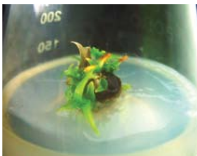
Proliferation of shoot buds

3% sucrose. Within 10-12 days of initial culture, proliferation of 11-13 shoot buds was observed from a single stem disc. Multiple shoots of 8-10 numbers/explants were produced after 4-week of culture. Rooting of the micropropagated shoots were readily achieved in IBA (0.1-0.25