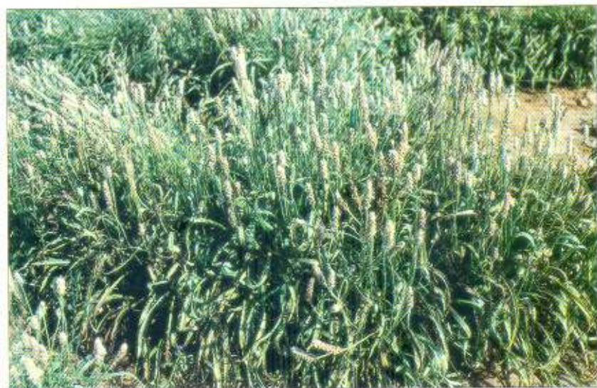
Leaf infection of downy mildew

Downy mildew caused by Peronospora plantaginis is the