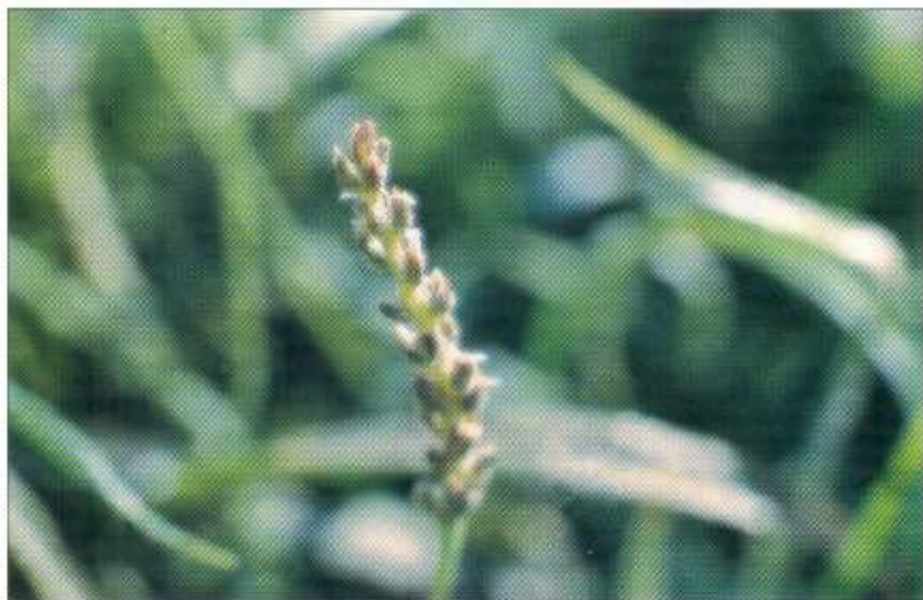
Floral infection of downy mildew

major disease problem of Isabgol. Early sowing, higher seed rate, frequent irrigations make the crop more susceptible to this disease. The disease can effectively be controlled by seed treatment with metalaxyl (Apron SD at 5g per kg seed) followed by three sprayings of combination product of metalaxyl and mancozeb (Ridomil MZ 0.2%) at a 10-day interval. First spraying must be done at first occurrence of disease. Effective disease management increases seed yield by more than 40% over the untreated diseased crop. Other disease such as damping off, leaf blight etc. do not cause much damage to the crop under normal cultivated condition.