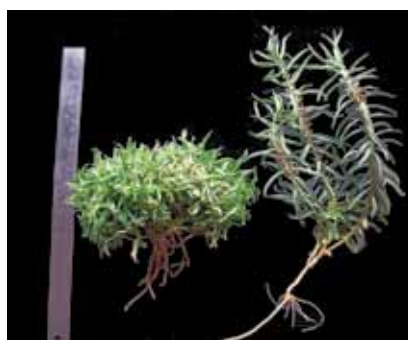
Infected and healthy plants of Mamejo

M amejo ( Enicostemma axillaris ) is a perennial herb distributed throughout most part of India to an altitude of about 450 m. The plant is very bitter and is used as an anthelmintic in Ayurveda . The shade dried whole plant is also having cooling, tonic, stomachic and laxative properties and is also used in the treatment of diabetes. The bitter principle which is responsible for its therapeutic action includes, glucosides, swertimarine,