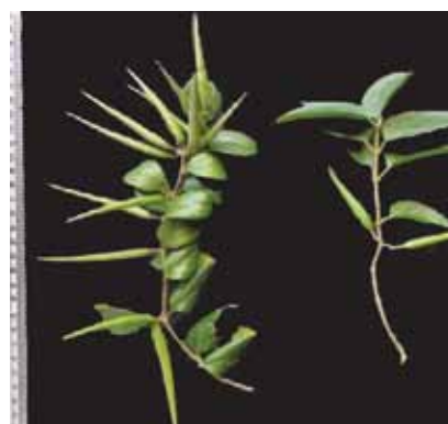
High and normal fruit bearing Madhunashini

tolerance in clinical studies. The heavy demand for this crop in medicinal sector leads to over harvest from its wild source. Hence, systematic cultivation is needed. The plant is usually propagated through seeds and rooted cuttings. Genetic variability of G. sylvestre was collected from various agro-climatic regions of India and are being evaluated for morphological and chemotypic variations at DMAPR. Out of 34 accessions tested, 3 accessions viz., DGS 20, DGS 22 and DGS 23 produced profuse fruits (1.5 years old plants) as compared to the